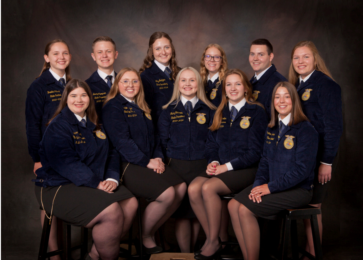
2023-2024 Wisconsin State FFA Officer Team